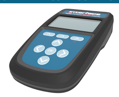
MODEL 9325 (Shown)