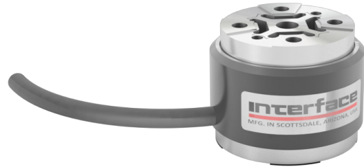
MODEL MRTP (Shown)