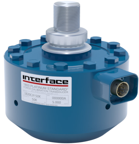
Model 1820CJY-50K (shown)