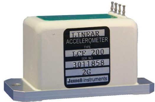
Dimensional Diagram: LCF-200 Series Accelerometer

The Jewell LCF-200 Series Flexure Suspension Fluid Damped Accelerometer is a \pm 0.5G to \pm 5G device designed for applications where high levels of shock and vibration are present. LCF units are characterized by excellent turn on repeatability and very low hysteresis.