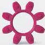
Type A Shore hardness 98 Sh A

The coupling is backlash free due to pretensioning of the elastomer insert between the two coupling halves. The Servomax-Coupling compensates for lateral, angular and axial misalignment.