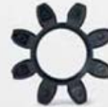
Type D* Shore hardness 92 Sh A