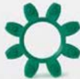
Type B Shore hardness 64 Sh D