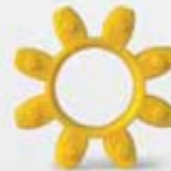
Type C Shore hardness 80 Sh A