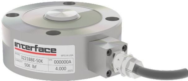
Model 3221BBE-50K (Shown)