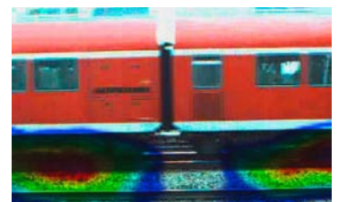
Fig. 2 Noise emission at the bogie

As the example illustrates it is within the realms of possibility for the Acoustic Camera to analyze scenarios with a high temporal resolution.