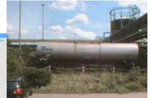
Fig. 4 Unloaded tank wagon