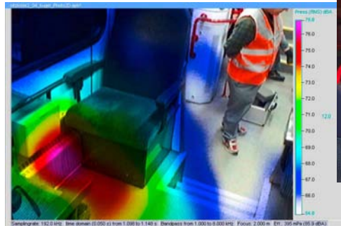
Fig. 5 Acoustic Photo 2D of emission from heater