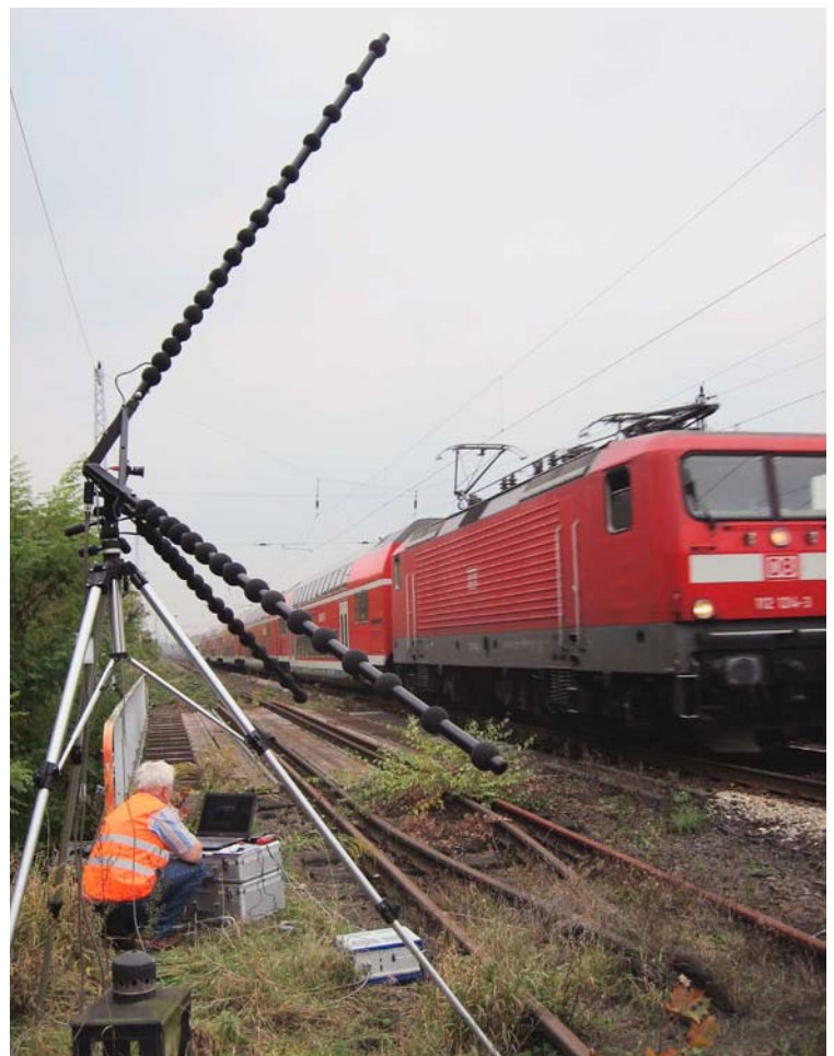
Fig. 1 Measurement set up for train pass-by at 120 km/h

The scenes were measured with a Star48 and a Sphere48 Array. Both measurements were conducted with a mobile power supply and took less than 10 minutes. For the fitting of the array position into the 3D CAD model another 5 minutes were needed while the microphone array Sphere48 was positioned on a passenger seat.