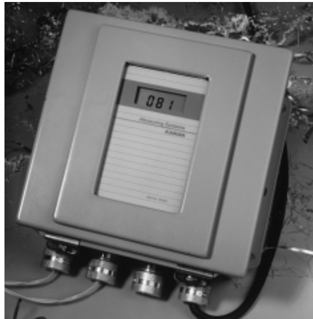
▲ Series 8000 NEMA enclosure