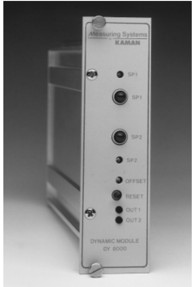
▲ DY-8000 dynamic module