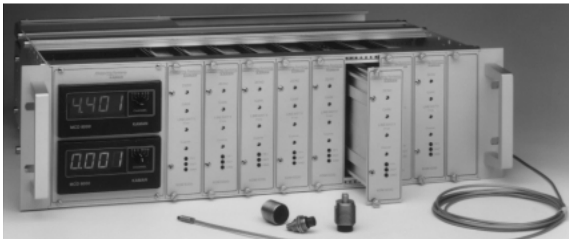
◀ 3U/84HP 19-inch rack