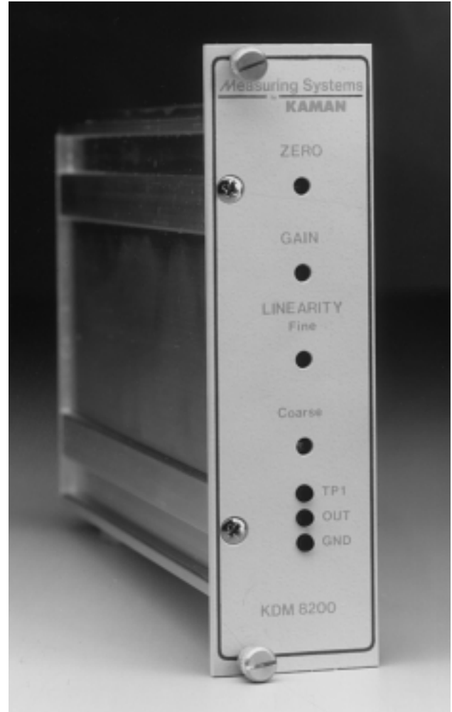
▲ KDM-8200 position measurement module