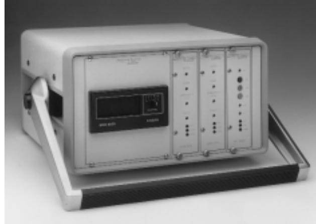
▲ 3U/42HP bench-top half rack

NEMA 12 enclosure holds two channels, one function card, integral display, and power supply. 8.14"W x 8.18"L x 4.64"H (208 x 209 x 118 mm).