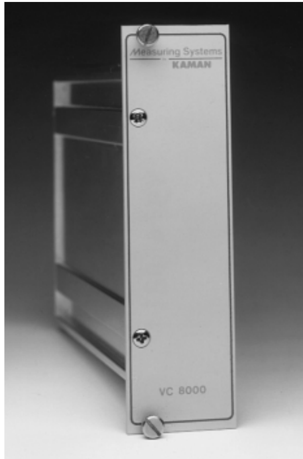
▲ VC-8000 voltage-to-current converter module