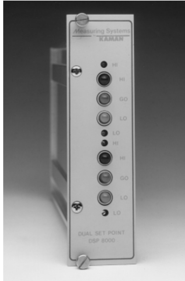
▲ DSP-8000 dual set point function module

The DSP-8000 can provide progressive comparison indicating GO, ALARM, or SHUT DOWN. The module also features a part present/set point inhibit. This feature inhibits the HI, LO, and GO outputs.