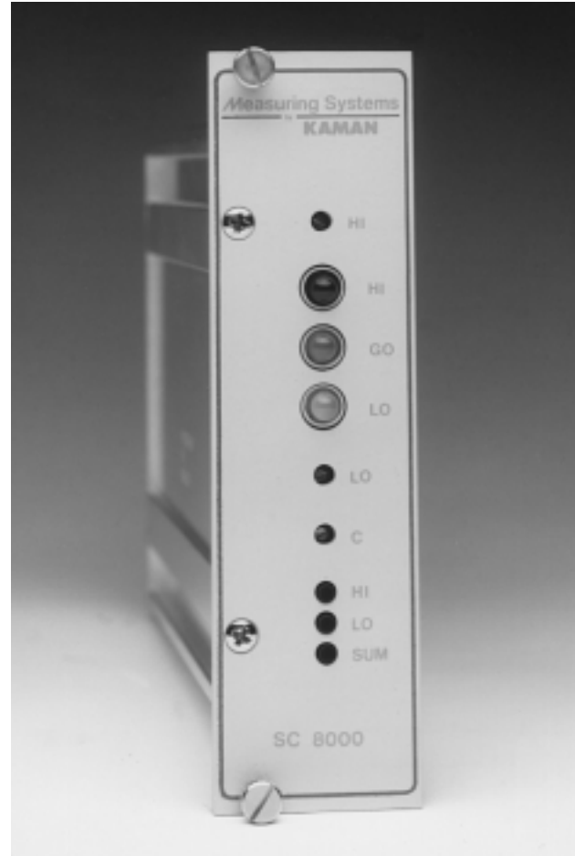
▲ SC-8000 summation/comparator module

As in the case of the OD measurement, C is the separation of the two sensors, and A and B are the distances from the two sensors to the target. The C+(A+B) function provides absolute ID, or deviation from a nominal ID.