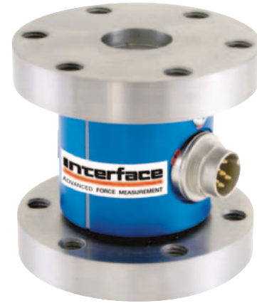
TS11 Flange Style Torque Transducer