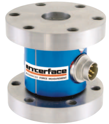
TS11 Flange Style Torque Transducer