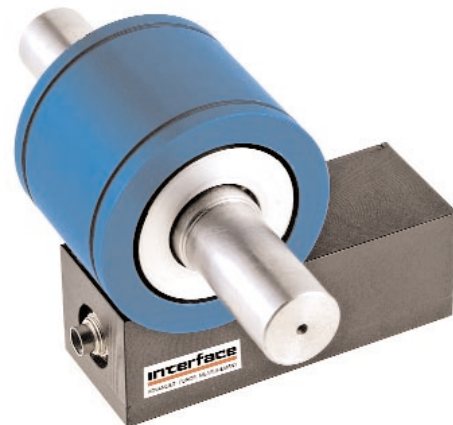
T11 Bearingless Torque Transducer