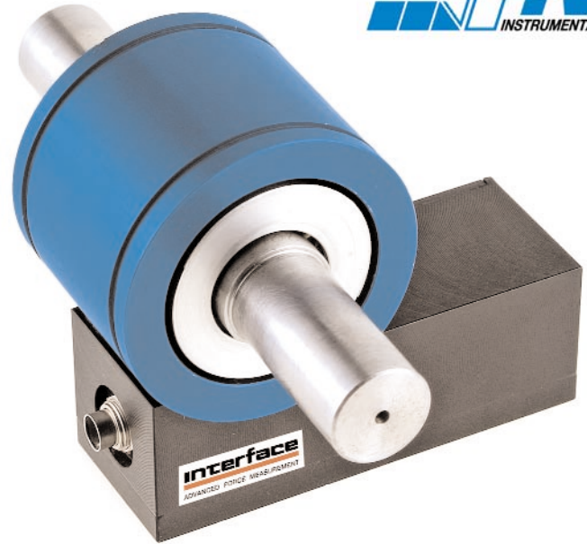
T11 Bearingless Torque Transducer