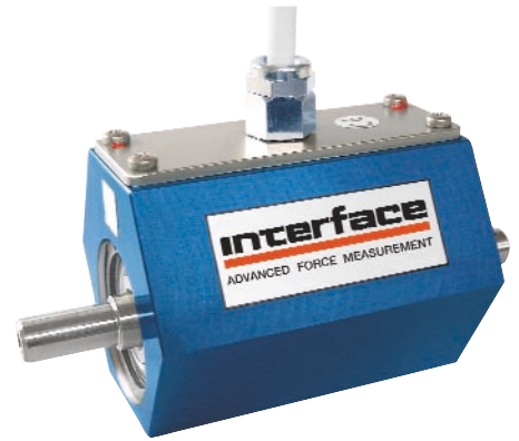
T8 LC Rotary Torque Transducer