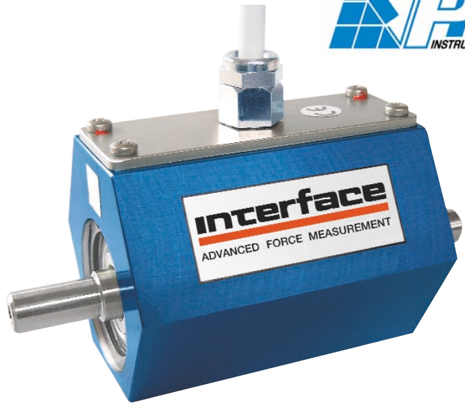
T8 LC Rotary Torque Transducer